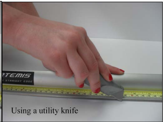
Using a utility knife